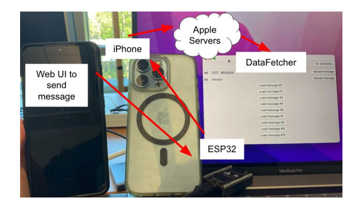
Figure 2: Photo of experimental setup. We will show through a website application that we can send data from a mobile phone to an ESP32 with the Send My firmware, which will then upload that data to Apple's cloud servers through Apple devices that are connected to the Find My network. We show that we can then retrieve the data on our Macbook through the DataFetcher application.

in turn upload them to Apple's servers. Finally, we then show that we can retrieve the message through the DataFetcher application on our MacBook.